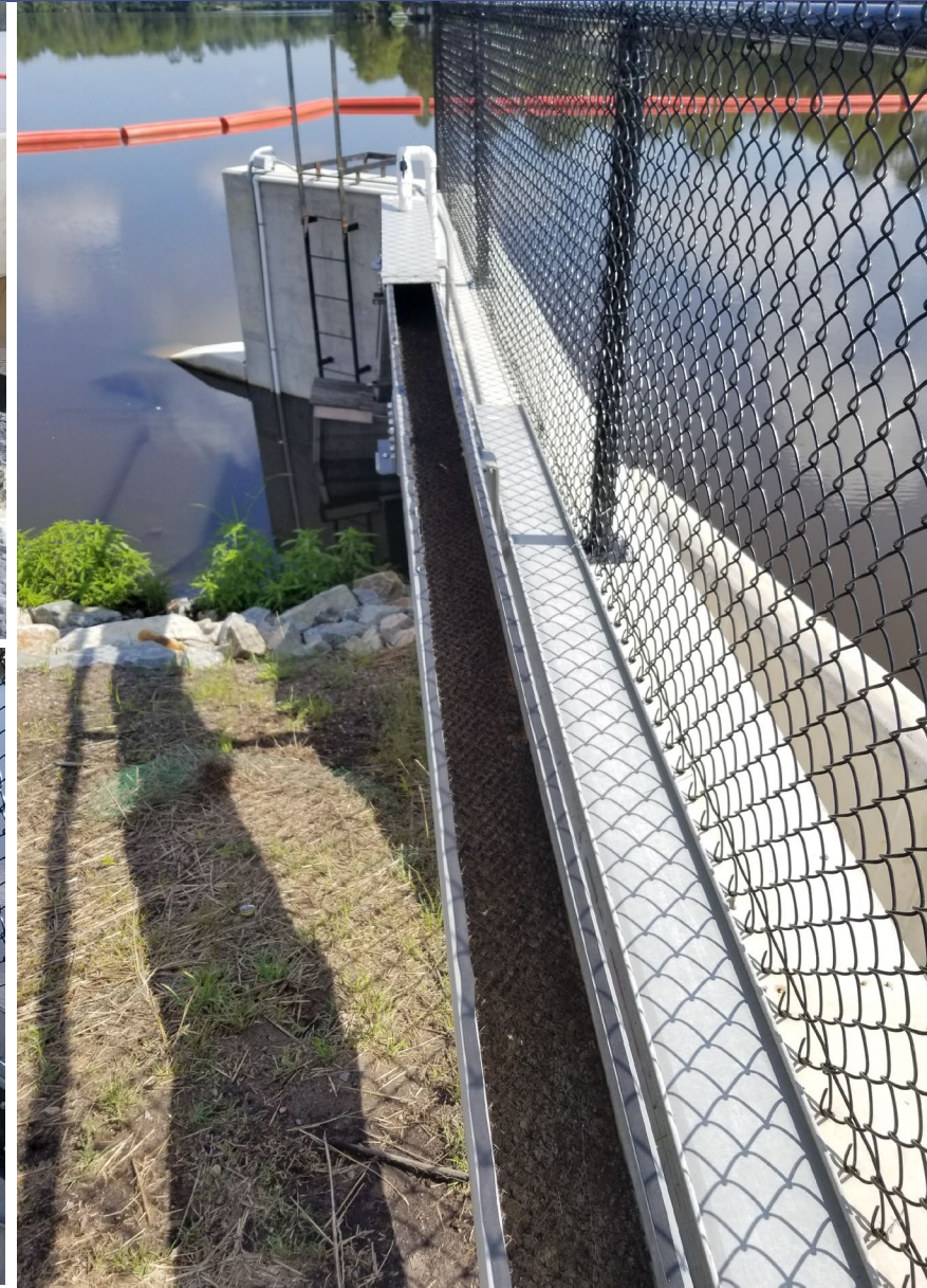
Eel passage at Hope Mills Dam